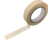
EFFISUS 2ADJOIN DF (double side tape)