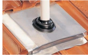
7. Effisus Stopper MR Tile For roofs with tiles