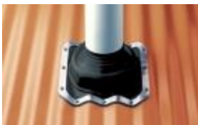
5. Effisus Stopper MR Selfseal With no need for a sealant