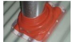
4. Effisus Stopper MR Silicone For penetrations with high temperatures