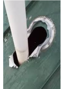
Penetrations with large / irregular dimensions