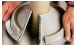
2. Effisus Stopper MR Retrofit For circular penetrations without access from above