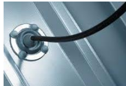
Electrical cable penetrations