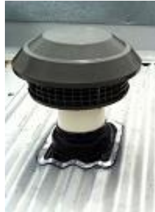
Tube or duct penetrations without access from above