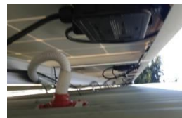
Tube or cable penetrations for photovoltaic systems