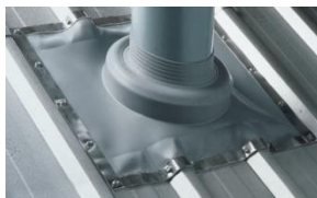
6. Effisus Stopper MR Universal For penetrations with large / irregular dimensions. Doesn't create barriers that stop waterflow.