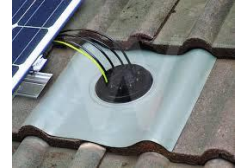
Multiple cable penetrations