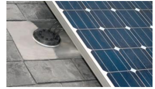
8. Effisus Stopper MR Solar For solar energy systems' cable penetrations.