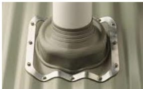
1. Effisus Stopper MR For circular penetrations