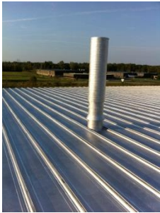
Tube or duct penetrations