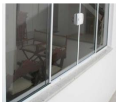
6. Sealing door threshold.