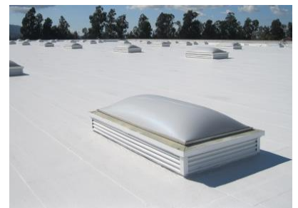
3. Sealing joints between skylights and the roof.