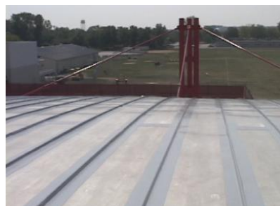
2. Sealing joints in roofs.