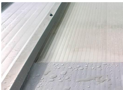
1. Sealing joints in polycarbonates.