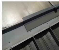
5. Sealing joints in metal flashings.