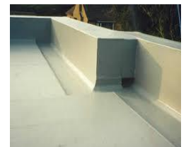
7. Sealing roof flashings / curbs.