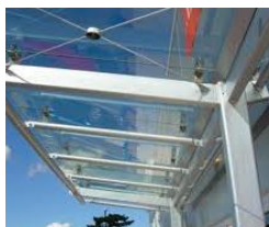
4. Sealing awnings or canopies joints / facade connections.