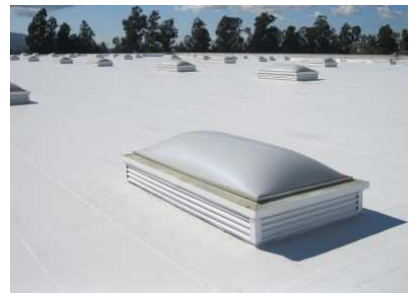
3. Sealing joints between skylights and the roof.