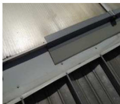
5. Sealing joints in metal flashings.