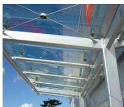
4. Sealing awnings or canopies joints / facade connections.