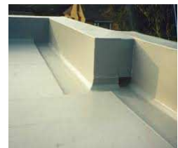
7. Sealing roof flashings / curbs.