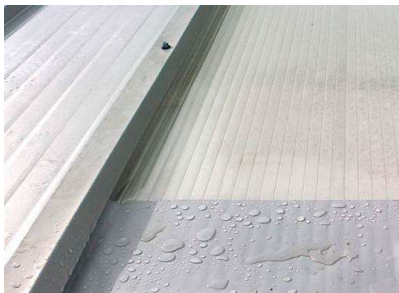
1. Sealing joints in polycarbonates.