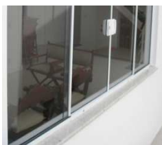
6. Sealing door threshold.