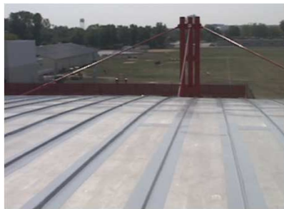
2. Sealing joints in roofs.